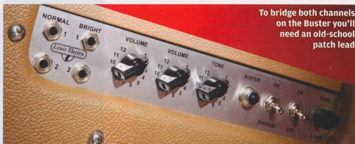
To bridge both channels on the Buster you'll need an old-school patch lead

With a Tele plugged into Normal 1 and all the controls at halfway, the KR12 has a crisp, throaty tone with lots of crunch and an element of